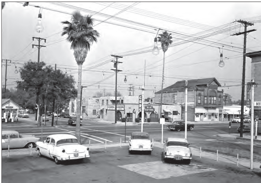
Avenue 63 & York Blvd. shortly before the demolition of the historic Miller's Hall, which is to the right.

give them eligibility for the City's Mills Act program, which is a property tax savings contract that is designed to encourage the preservation and restoration of those structures. The Highland Park-Garvanza HPOZ is the largest one in the City of Los Angeles and is the first to include a substantial commercial area as well as the residential neighborhoods.