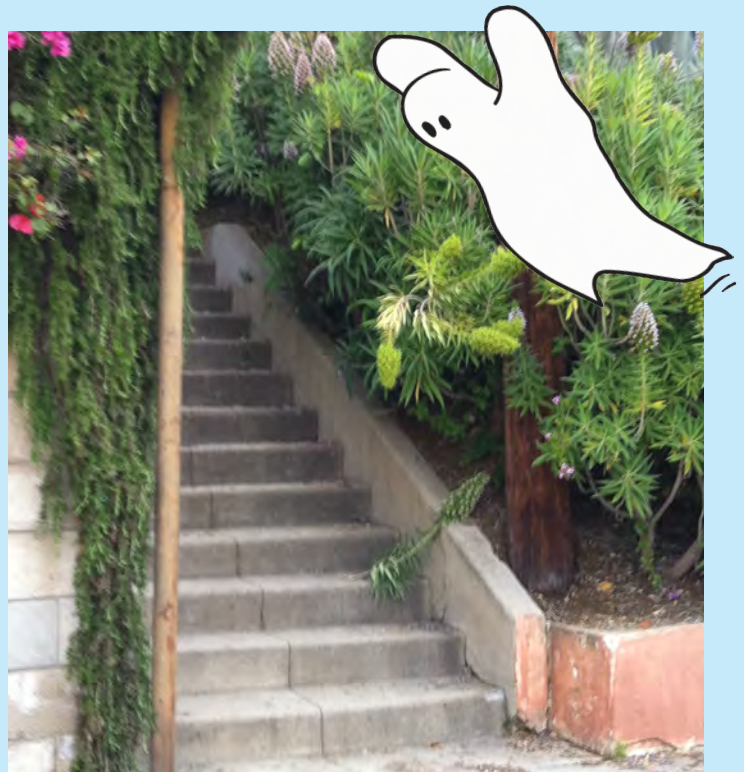
Metro Bus and the Highland Park Gold Line Station at N. Avenue 59 and Marmion Way.

Note that parking is extremely limited on Mt. Angelus; please use street parking on Piedmont Avenue in front of the Recreation Center; Accessible from the #83