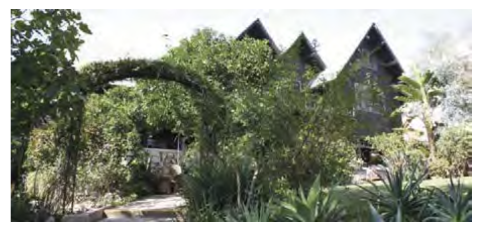
Baker House.

This is a great opportunity to volunteer as HPHT members as we are expecting 45 participants. The HPHT Docents are highly capable individuals who keep the bi-monthly Walking Tours going all year long but having charming and interesting members assisting is a welcome addition. Contact HPHT at info@hpht.org or (323) 908-4127 to volunteer.