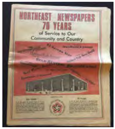
1975 Highland Park News-Herald and Journal

My favorite part of the annual event is that it attracts