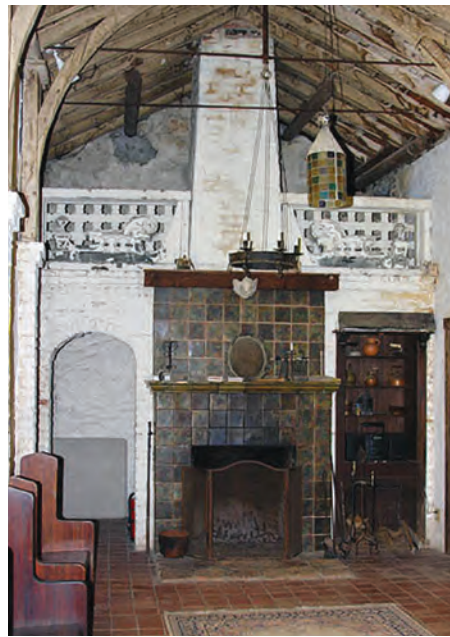
Abbey San Encino, Los Angeles Historic Cultural Monument #106

S unday, April 21, 2013, the Abbey San Encino Wine and Cheese Fundraiser and Tour for Preservation Advocacy is an opportunity to visit a place that is more than a residence.