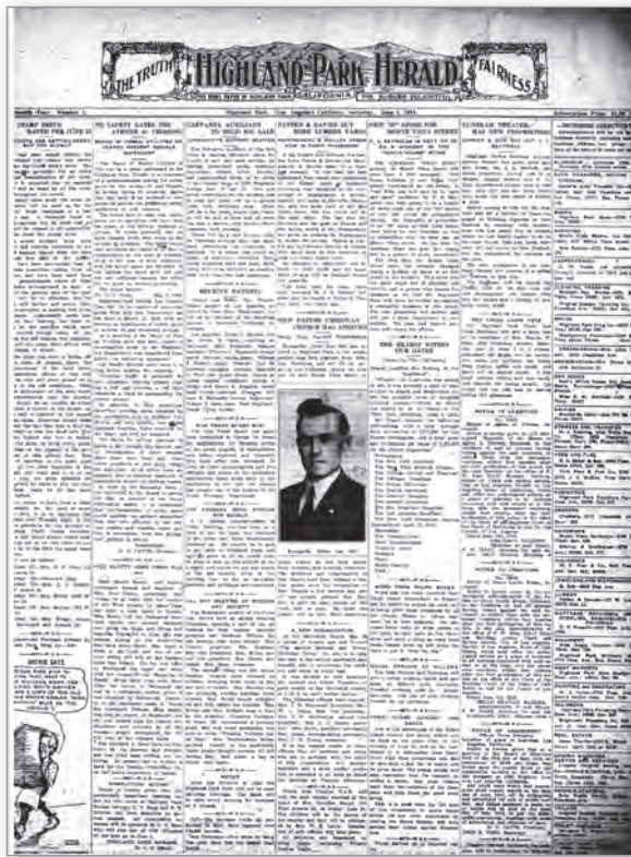
Highland Park Herald, June 8, 1918

The grant will fund an archivist/project manager