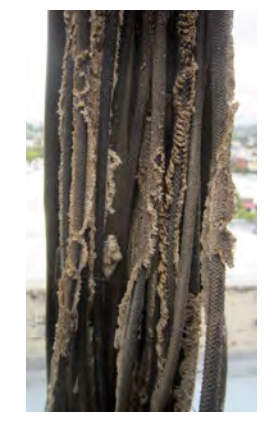
OMG! This is the current state of the wiring which we are endeavoring to fix for once and for a long time to come.