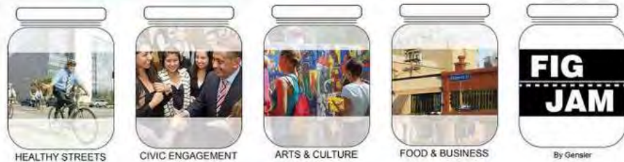
FIG JAM is a free one-day, all-ages, family-friendly, educational, and cultural event on North Figueroa that encourages long standing residents to mingle with new residents in the businesses, on the sidewalks and throughout the public space of their Great Street in Northeast LA. FIG JAM aims to improve North Figueroa by drawing attention to the street's rich past, recognizing its vibrant present, and sparking interest in its promising future.