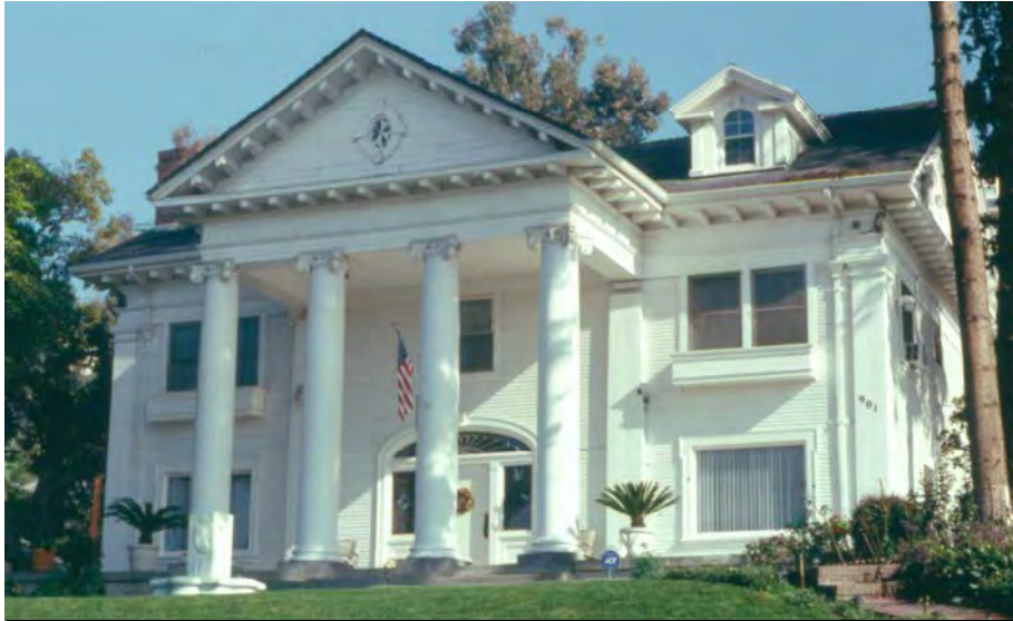
Nickel-Leong Mansion