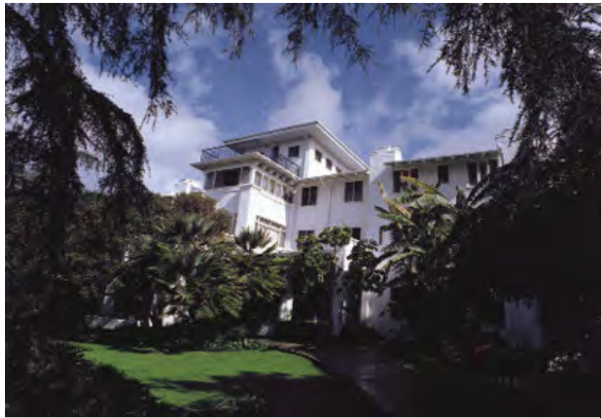
Self-Realization Fellowship/Mt. Washington Hotel

Marsh had the structure built by the Milwaukee Building Com-