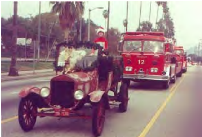
HPHT Highland Park Holiday Parade Entry "Model T" - 1994

Four electrically lighted stars, 18 inches from tips to tips will be used, one at the top of the Christmas tree and the others centering each of three garlands, marking the triangle. A surprise for children will be found at the base of the tree."