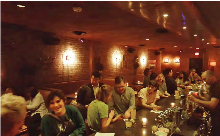
Hidden behind a barbershop, this lounge offers craft cocktails & modern pub bites in a hip setting.

Attendees hope we host more events like this one. Blind Barber would love to host more of these for us going forward. HPHT will announce a date for the next one, soon.