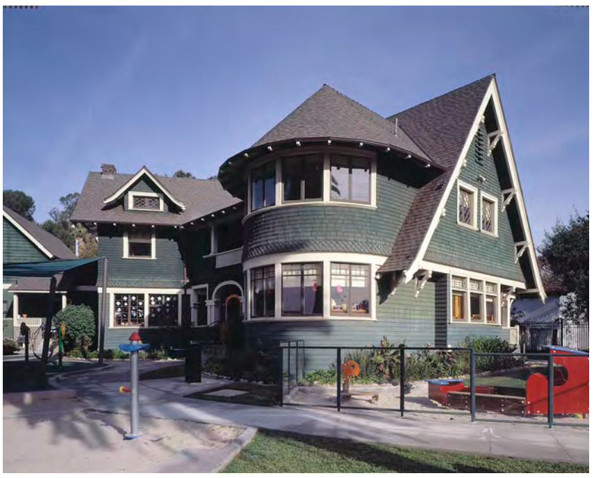
Ziegler House

conversation on Historic Preservation we have been listening to our members, talking with people in our immediate community as well as the larger Preservation community. There is a growing conversation around the ways the Preservation Movement and the Heritage Trust can build on our achievements while adapting new ways to use our preservation skills and toolbox. In particular, we have so many pressing