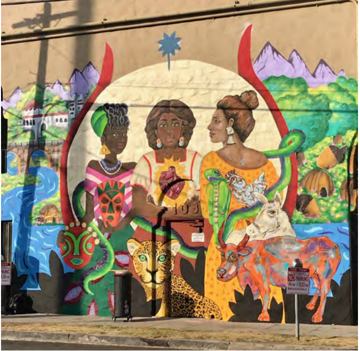
Highland Theatre, west façade

exchange stories about dealing with government entities and found that even with the luxury of the freedom of exchange we have with politicians our Athar Lina counterparts have been able to make inroads into age old concepts of what is worth being preserved and why. Remember, Cairo is in its entirety a World Heritage Site.