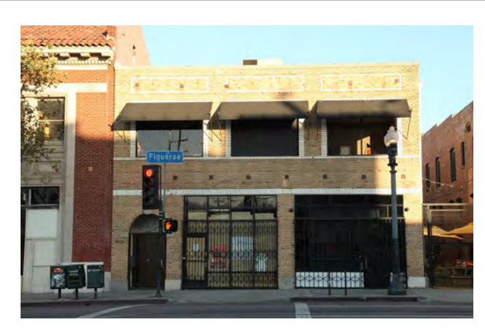
5607 Figueroa Street, former site of the Centro de Arte Publico

See President's Message (p. 2) for important updated information and how you can help this Historic-Cultural site nomination.