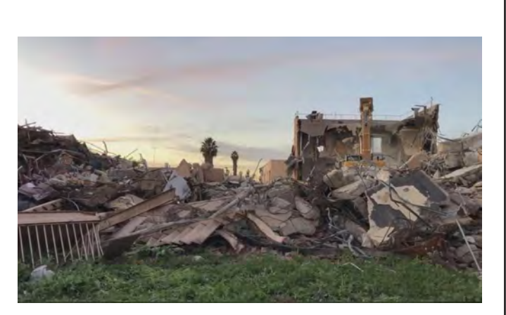
UPDATE: We regret to report that, on December 16, 2020, the German Hospital in Boyle Heights was demolished by order of the City of Los Angeles before a nomination could be heard. HPHT is disappointed and outraged by this loss of more of our historic places on the Eastside of Los Angeles.

See President's Message (p. 2) for important updated information and how you can help this Historic-Cultural site nomination.