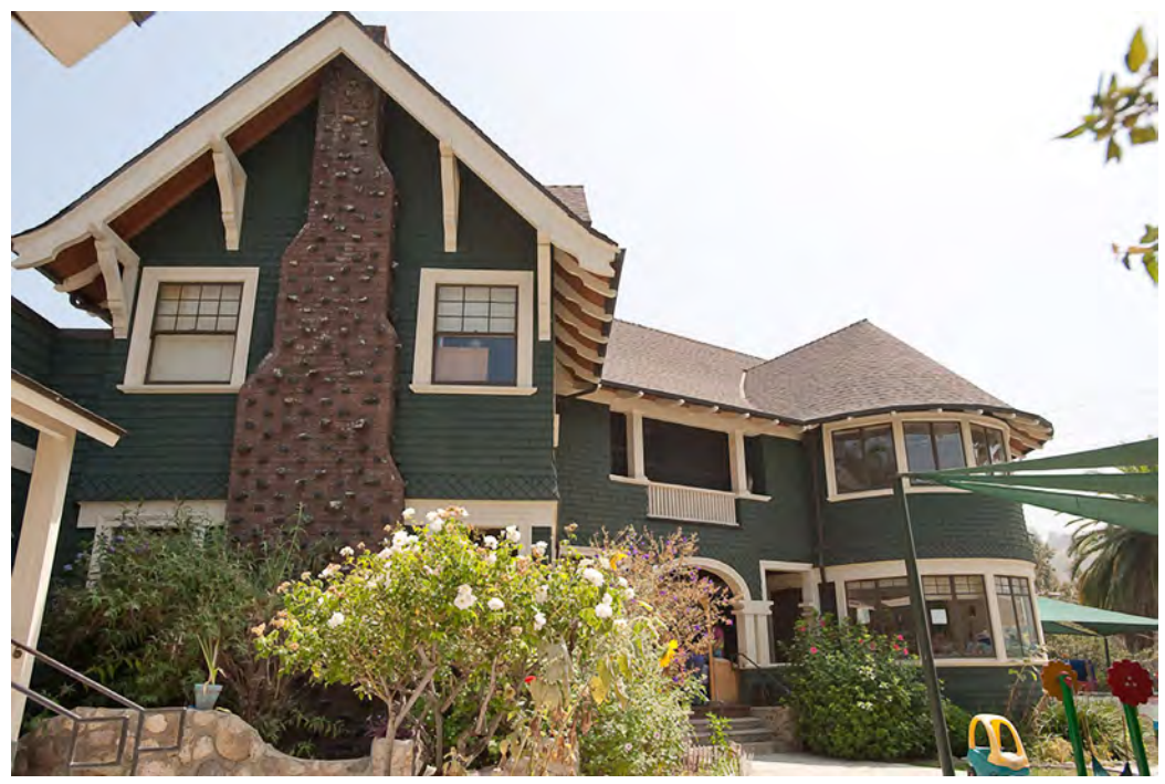
La Casita Verde Child Development Center at the Ziegler Estate, 4601 N. Figueroa Street, Los Angeles

ON JULY 1, 2020, the Mayor concurred with Council to approve $1.19 million dollars in federal Community Development Block Grant (CDBG) funds for upgrades to the City-owned Ziegler Estate in the Highland Park Historic Overlay Zone. Designated City Historic-Cultural Monument No. 416, this public asset is also listed on the National Register of Historic Places. Interior and exterior upgrades will address deteriorating conditions from intensive use as the Southwest Museum Station Community Services Center and outdated systems. The project will safeguard the